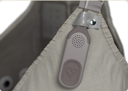
HeartPoint Alert Button